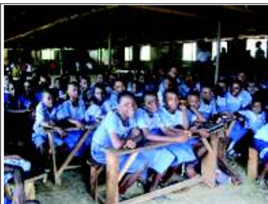
Upper Primary Students (6 th Grade)

The current situation of the Catholic schools indicate high performance capacities even in substandard classrooms and school buildings. It is amazing what teachers can do in very limited circumstances. Generally speaking, students pass the state exams and go on to the next grade. They learn through rote memorization and writing copious notes taken from the teacher's blackboard instruction. "Chalk and Talk" is a great saying of the teachers!