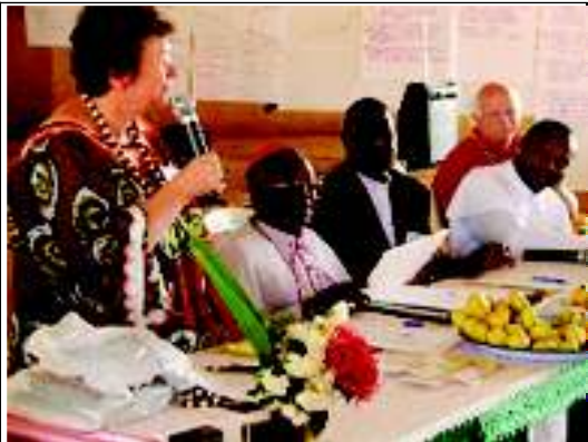
Future Search Conference May 2009 Bishop Francis Okobo

We have conducted training sessions to assess school buildings.