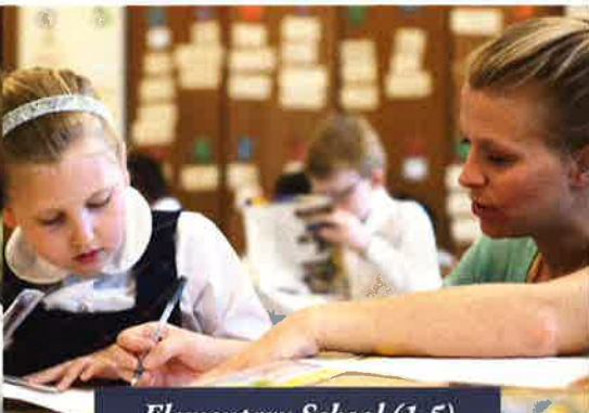
Elementary School (1-5)