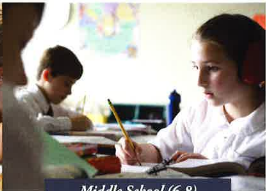
Middle School (6-8)

ICSJ's early childhood program is a play and center-based, NAEYC® accredited, comprehensive program designed to provide the best learning experience for our youngest students. Our teachers work with each child to ensure that his/her individual, educational, and developmental needs are being met, with a focus on physical, social and personal development, fine and gross motor skills and visual and auditory perception.