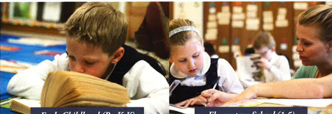
Early Childhood (PreK-K)

SOCIAL-EMOTIONAL INSTRUCTION: Social-emotional competencies are critical to academic success. Therefore, ICSJ utilizes multiple social-emotional programs, including Responsive Classroom and Second Step, across all grade levels to create a safe and joyful learning community. Working with classroom teachers, ICSJ's three full-time counselors integrate multiple behavioral and emotional strategies into everyday classroom lessons.